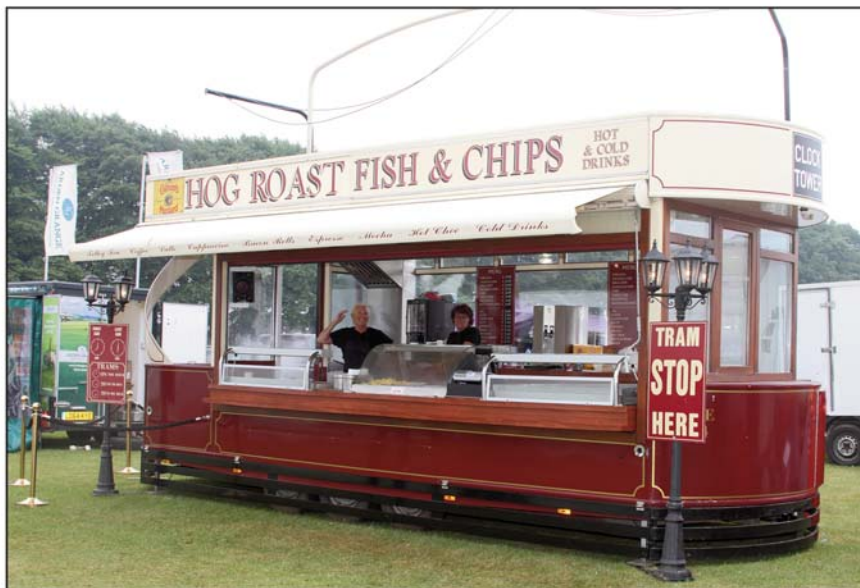
Fully Restored and Converted Blackpool Tram

Catering For All Main Events To The Highest Standard