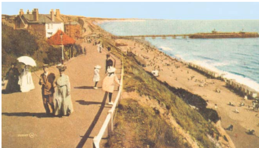
Bournemouth from West Cliff