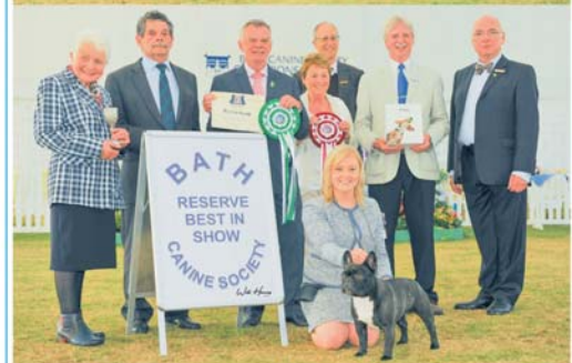
Best in Show & Reserve Best In Show 2018

Superb coverage of the show scene in the UK, Ireland & Europe